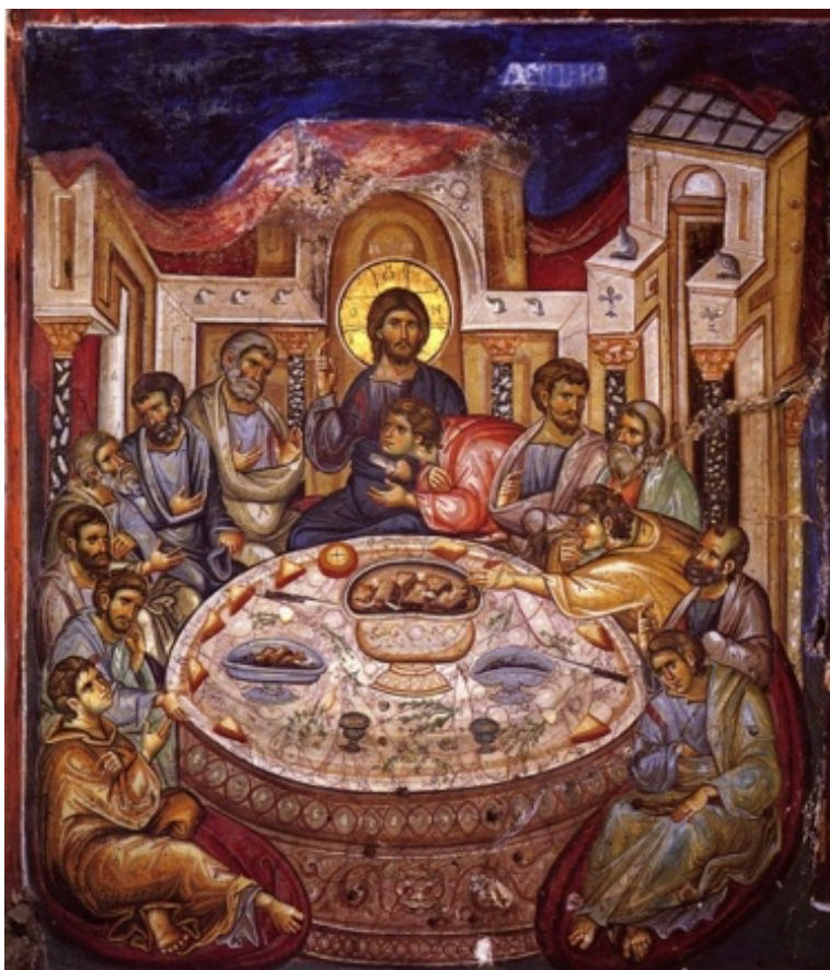
The Mystical Supper

The traitor takes the Bread in his hands, but stretches them out secretly to receive the price of Him Who fashioned man with His own hands. For Judas, slave and deceiver, still repented not.