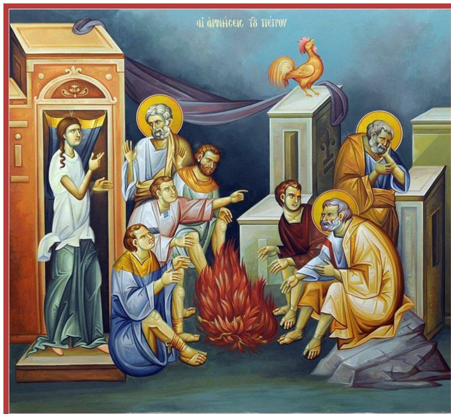
The Denial of Peter